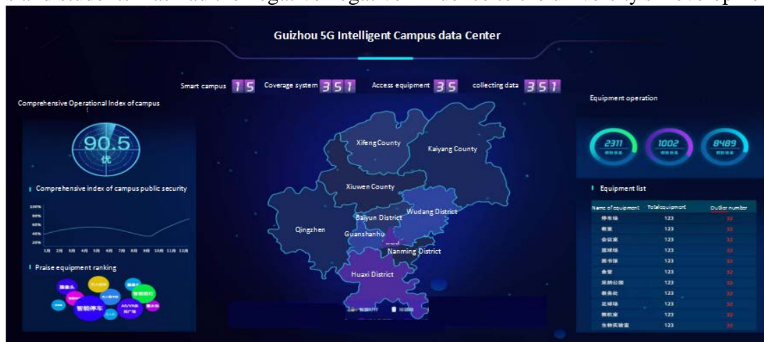
Fig.2 Smart Campus Data Analysis